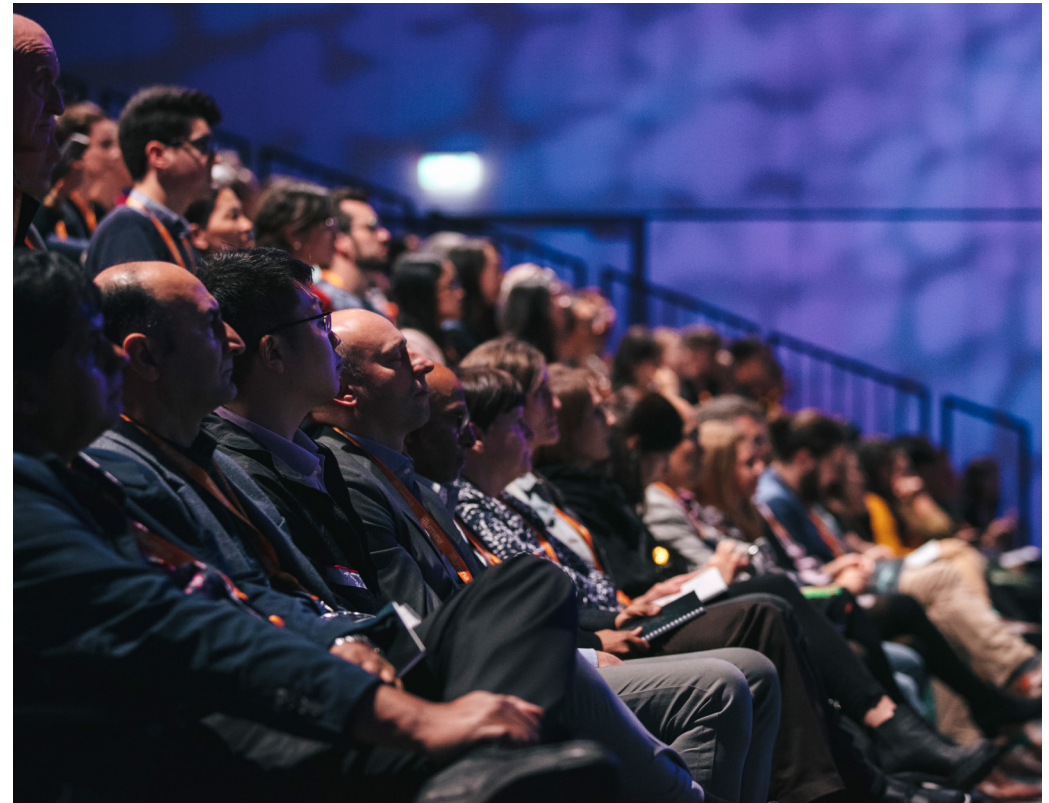
ANS 39th Annual Scientific Meeting of 2019